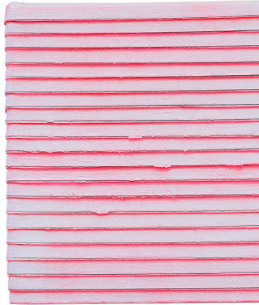
Paolo Bini - Monochrome

Each stripe is painted and applied to the support, a canvas or a panel, as a singular grammatical element of a wider period, the phrase of a language built step by step. The modules, distributed by a precise order, cover a homogeneous area and develop a complete structure. The result is the combination of actions which, in reality, become the synthesis of different languages, from the Lyrical abstraction to Neo Geo, from Minimalism to Conceptual art via Informalism and Action painting.