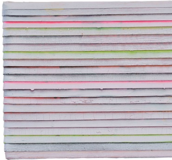
Paolo Bini - Monochrome

At the core of everything there is colour. Colour translates the emotional geography of the landscapes seen and lived by the artist during his many trips in the Mediterranean, South Africa and continental Europe. It looks like a stratification of memories, a juxtaposition of temporal layers recognized as single memories, independent impressions put back together by the artist for a wide and