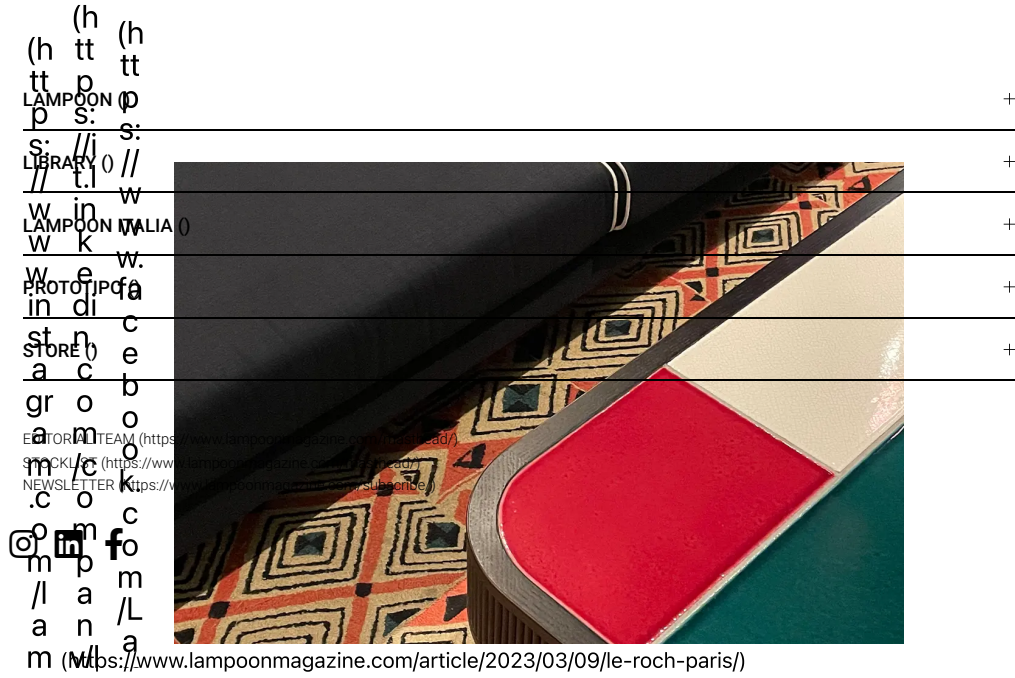
Le Roch in the Saint-Honoré neighborhood, between the Louvre and Opéra Garnier